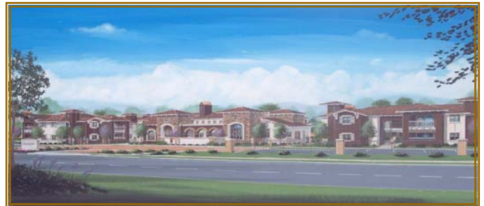
Artist Rendering of Hacienda Heights

The project consists of 2 and 3 bedroom units that will feature a community room, computer center, swimming pool, playground and barbecue area.